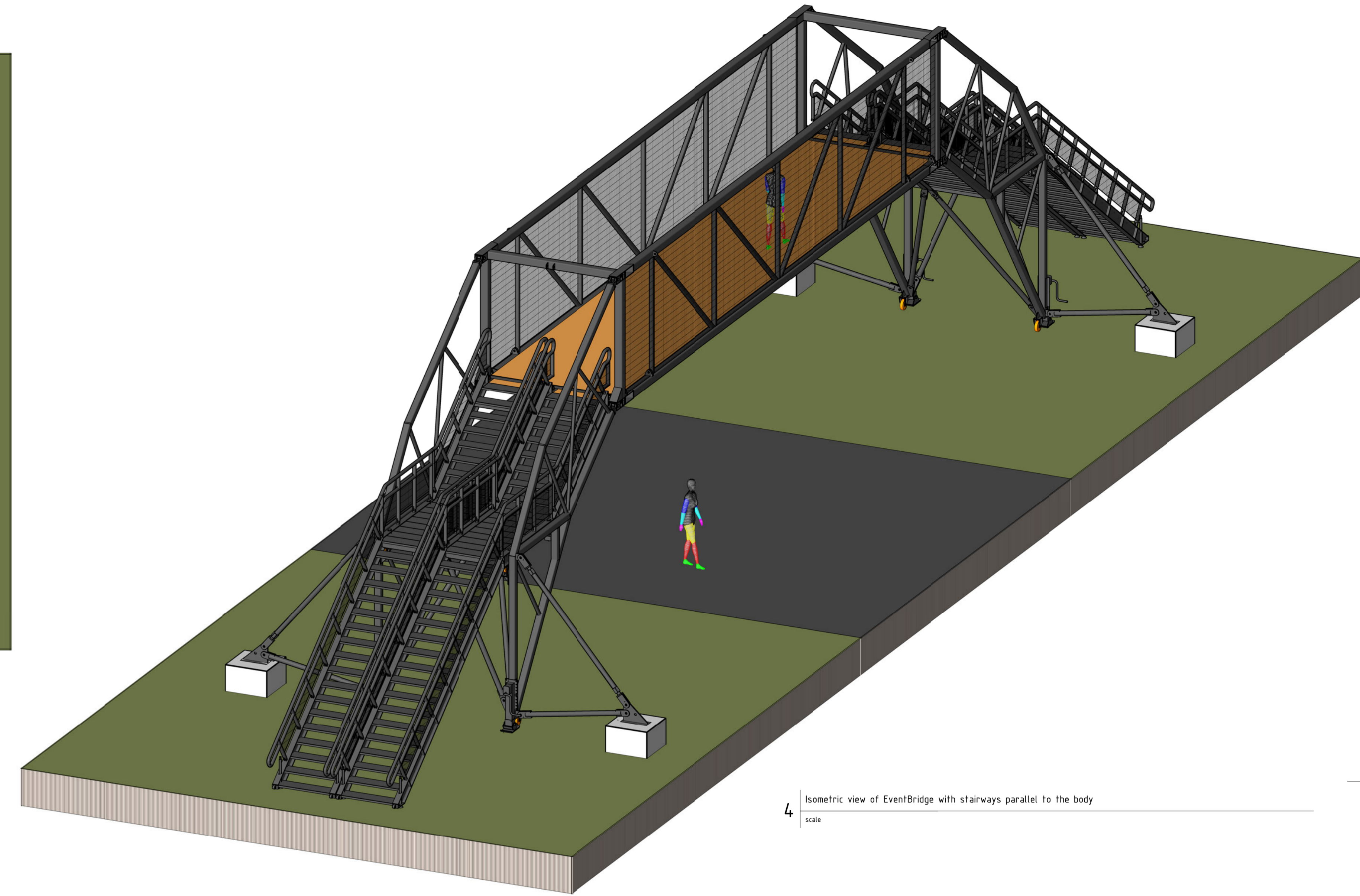
4 Isometric view of EventBridge with stairways parallel to the body scale